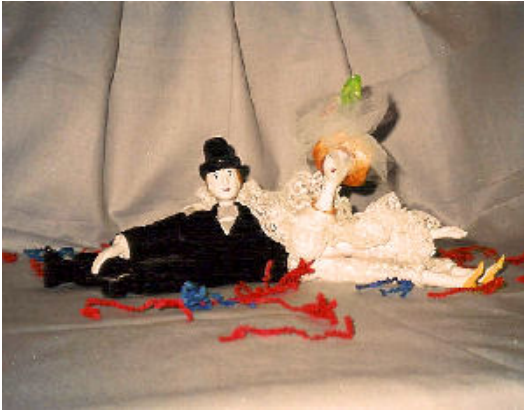
“ Les Mairies” – Bride and Groom

Thanks to their flexible bodies, CERRI'ART dolls adopt all kinds of playful poses, even the most unexpected. Far from being inert objects, they are living creatures who radiate fantasy, gaiety and humor and capture your attention the moment you enter a room. To the delight of collectors, they are traveling all over the world – no doubt in First Class!